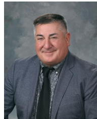
Sen. George Munoz (D) Senate Finance Chair District 4 (Gallup)